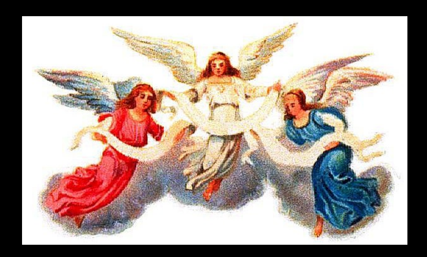
There Is No Other Way